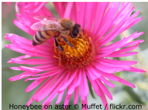
Honeybee on aster