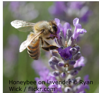
Honeybee on lavender